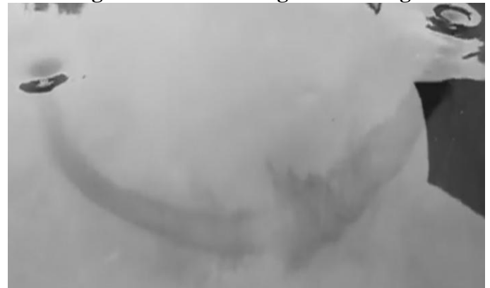
Figure 3 Half Toroidal Ring Structure in Water Using Dye [16]

Twentieth century experiments have demonstrated that the electric charge of elementary particles is quantized. Most elementary particles have a charge of e equal to 1.602 \times 10^{-19} coulombs. However, some particles called quarks have charges which are integer multiples of 1/3 e . Thus quantization of charge suggests that the electron and positron consist of 3 negative and 3 positive monads respectively. The proton consists of even more monads, because it contains both monads and anti-monads in order to have a greater mass than the electron and positron.