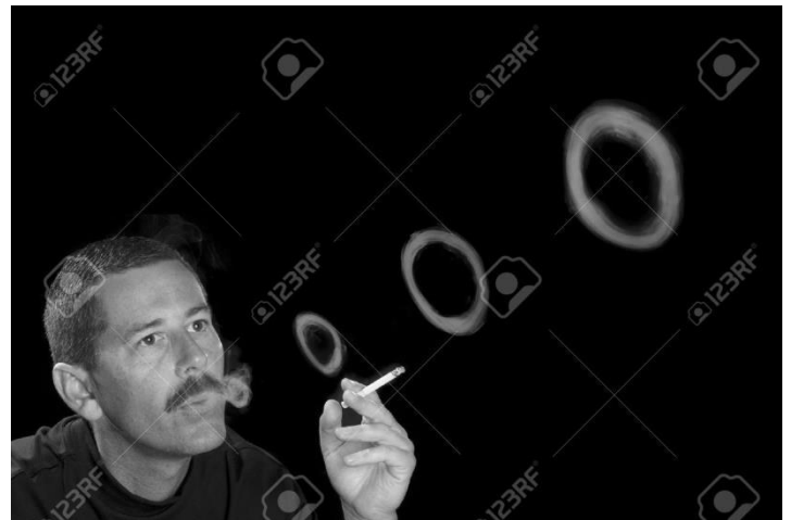
Figure 2 Man Blowing Smoke Rings

Twenty-first century experiments with the fluid dynamics of air have demonstrated the creation of toroidal solitons with smoke rings. Experiments with the fluid dynamics of water have demonstrated the creation of toroidal and half toroidal structures in water by adding dye to the vortices of the water.